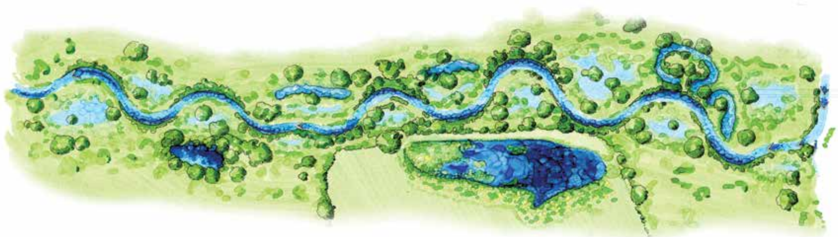
First Mine Run Restoration Rendering by our Director of Design