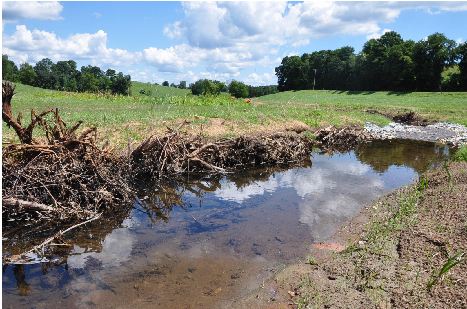
After – As-built toewood structure to reduce shear stress on outer meander banks and provide habitat