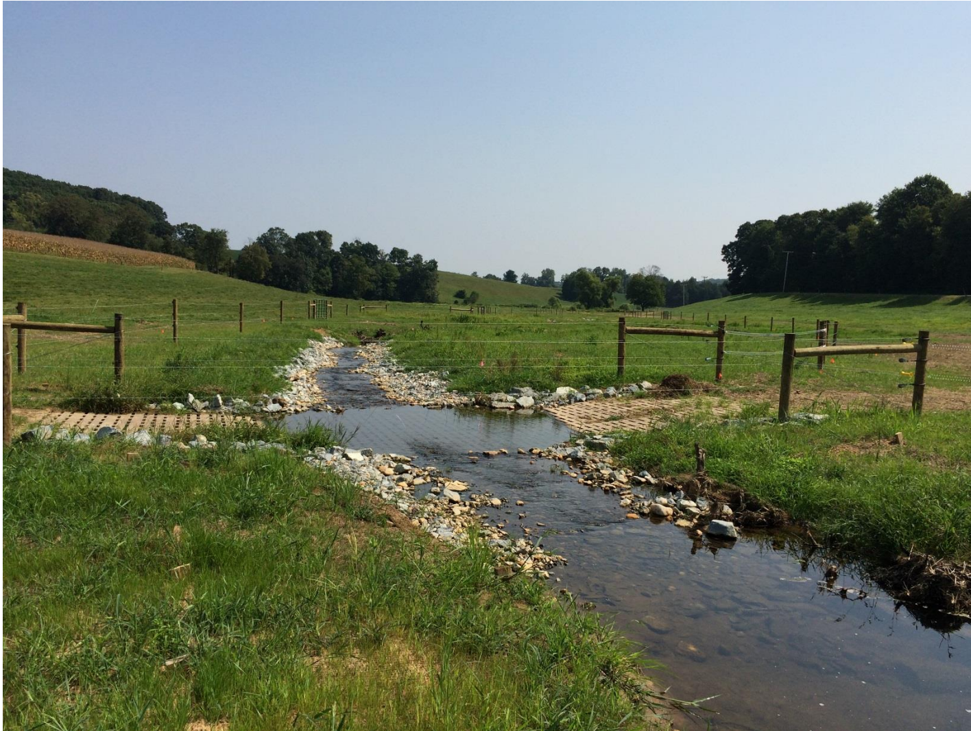
After – As-built livestock exclusion fencing and cattle crossing