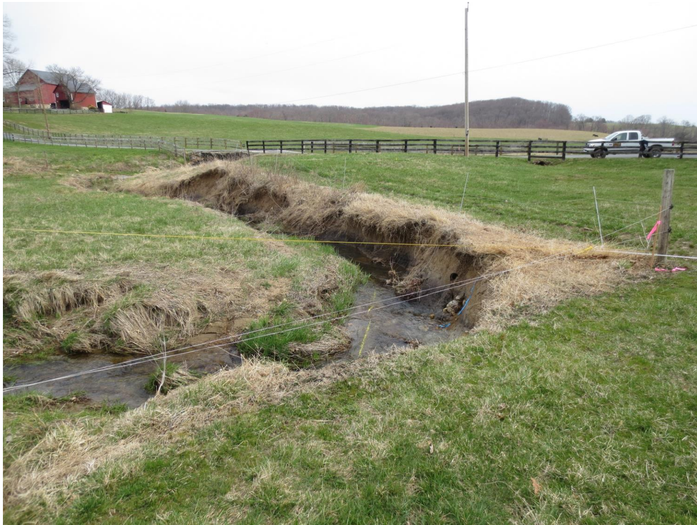
Before – Incised banks, high erosion, meandering stream