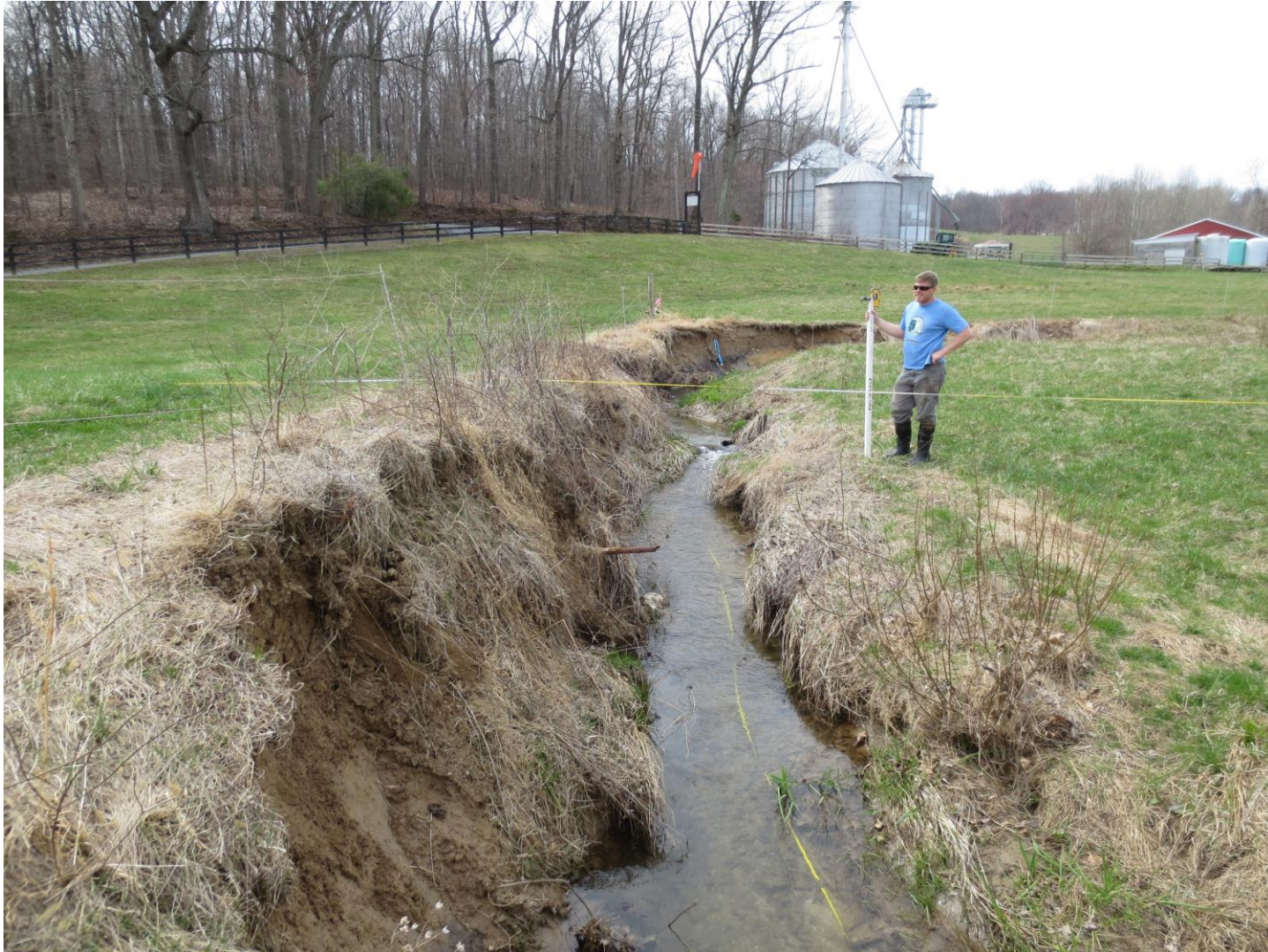
Before – Incised banks, high erosion, little vegetation on banks