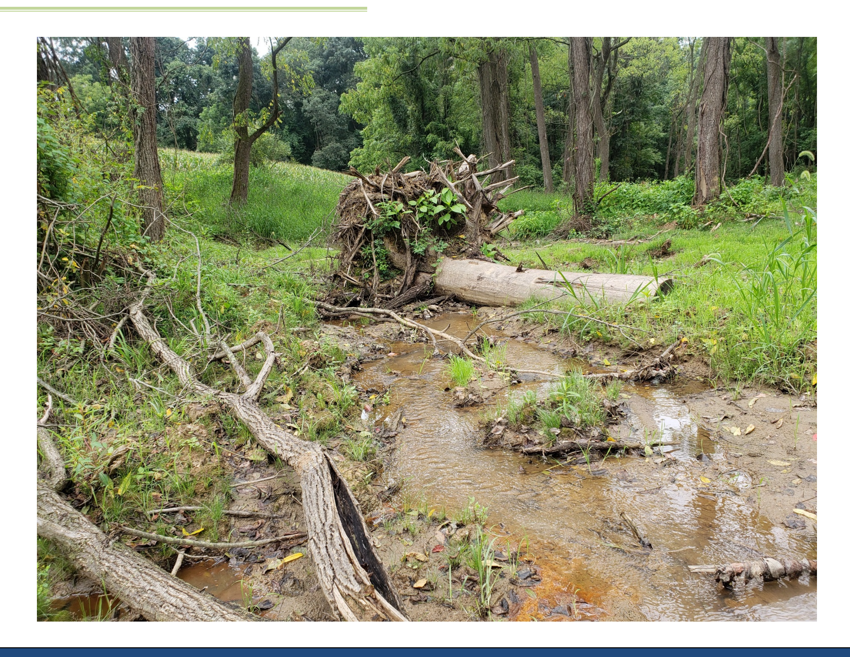
After – Large woody debris and a multi-threaded channel.