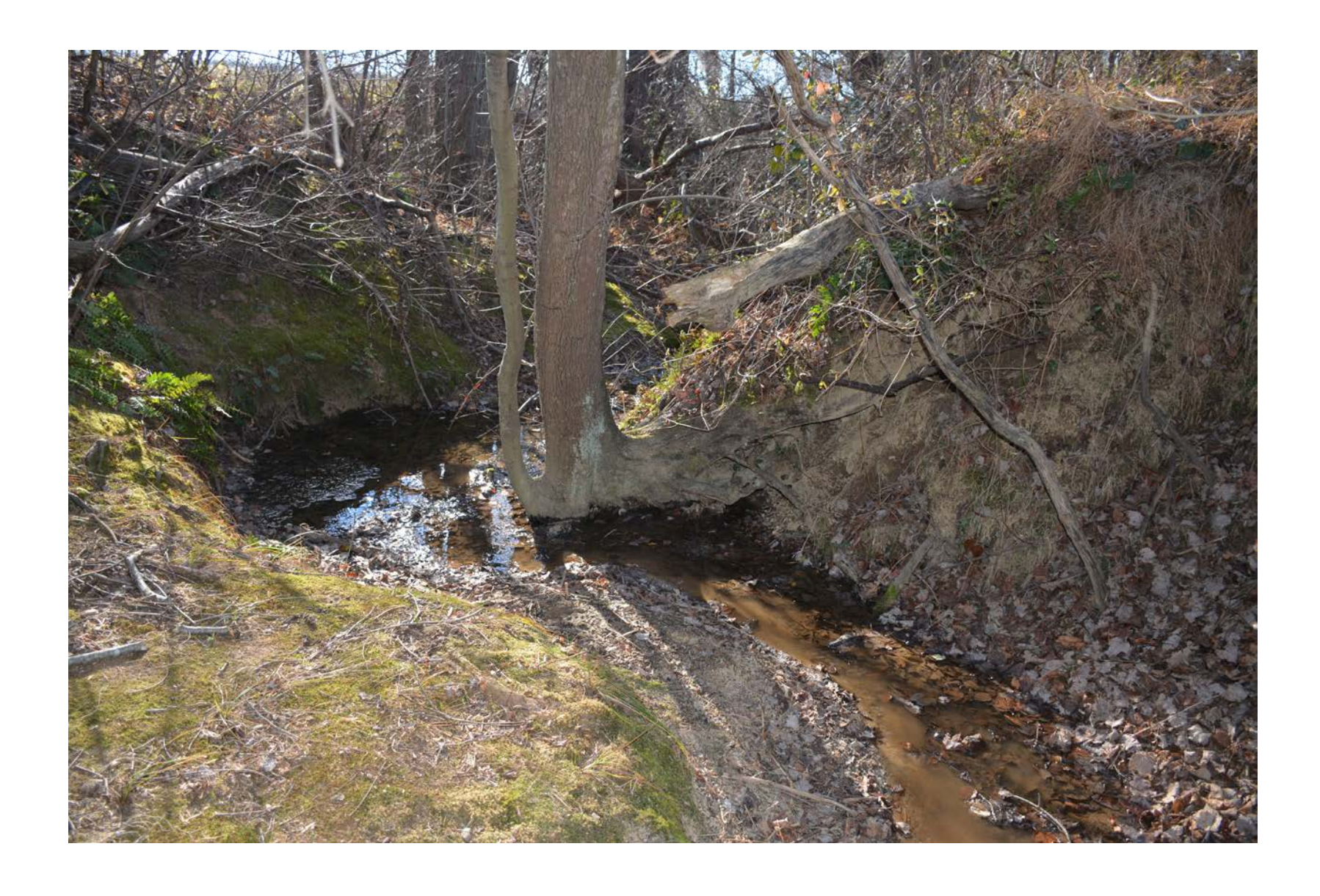
Before – Meander migration with sheer banks, more exposed roots and woody debris