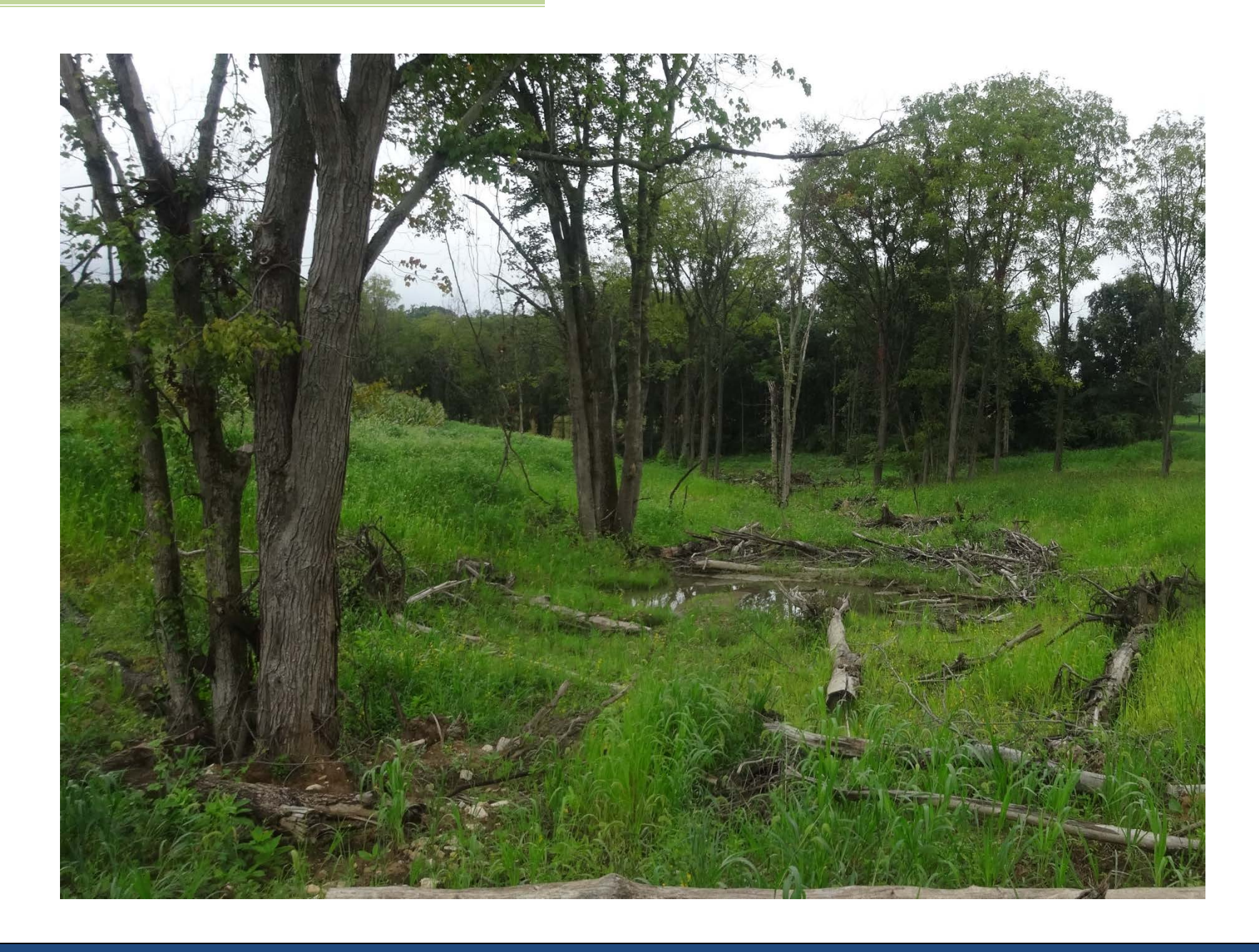
After – the resulting stream resembles a forested stream-wetland complex.