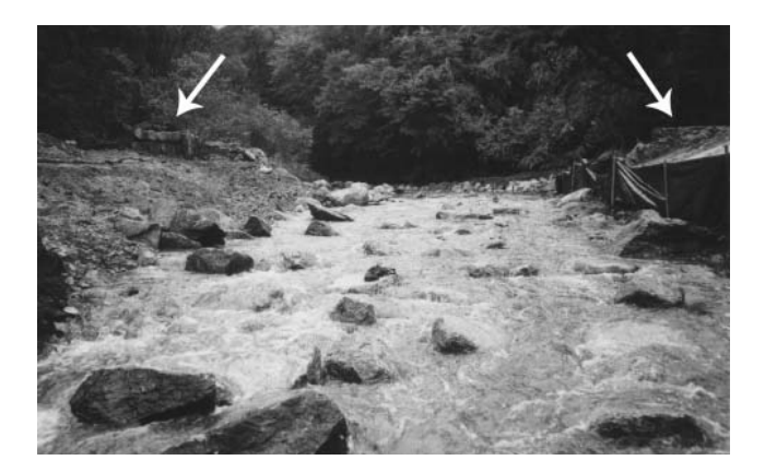
Figure 2. Example of a dam removal approximately one week following removal. View is facing upstream from within the area of the removed dam. White arrows mark the remaining abutments of the original dam face. The channel has been created by removing impounded sediment to match the shape of a downstream reference reach. Cobble substrate placed on the streambed will resist erosion in accordance with sediment transport theory. The banks are cut to a stable slope, stabilized at the base with large cobbles, and seeded with native vegetation. Compare with the channel in figure 1b.

In comparison, the analogous beaver dam failure creates a beaver meadow, where the channel cross section is visibly narrower and deeper than the upstream or downstream reference on the same river (figure 1b). Since the channel in the meadow erodes out of previously impounded sediments, the bed is generally finer in size than the reference. Scattered cobbles on the bed surface, the result of bed coarsening, demonstrate the trajectory of the channel as it transitions to a state similar to the reference. Although the channel is actively eroding, most of the impounded sediments remain vegetated in place in the riparian zone.