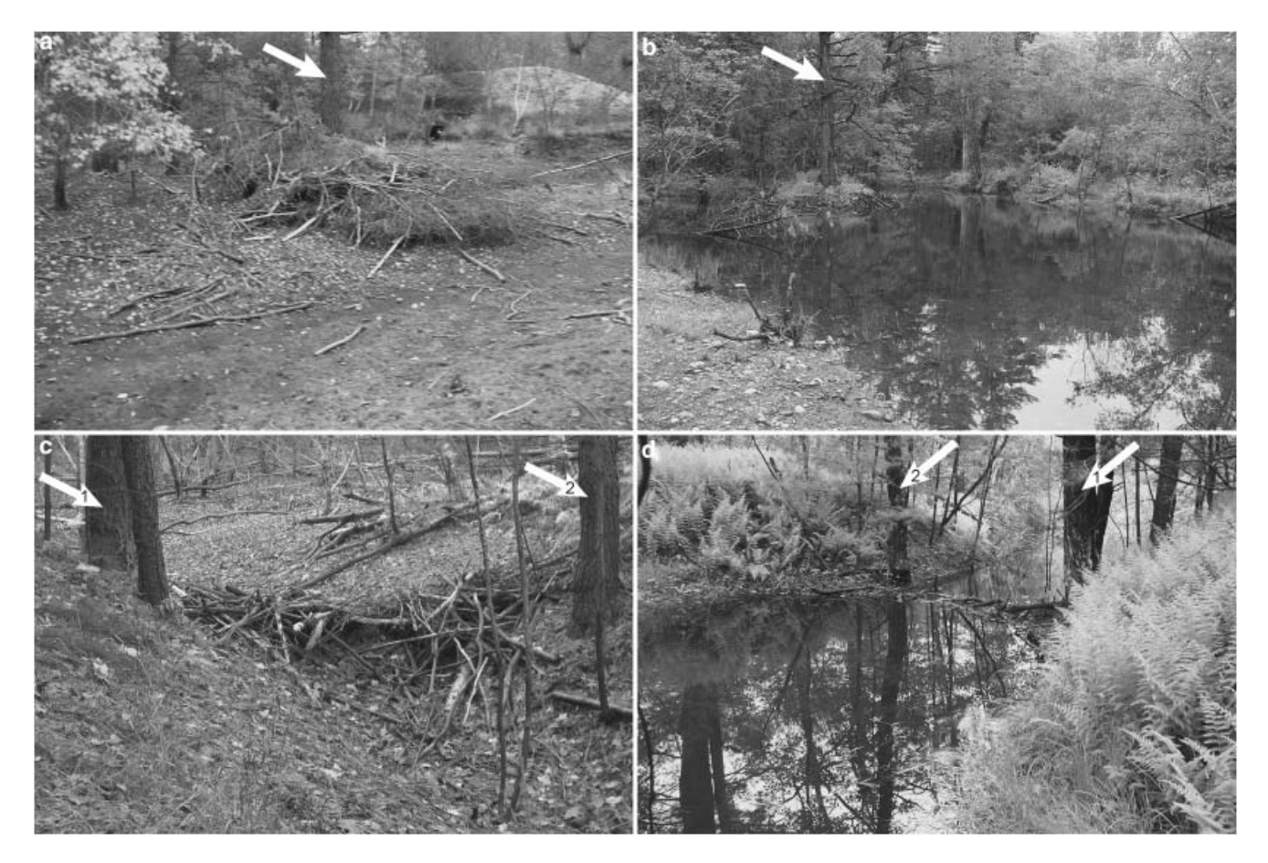
Figure 6. Example of modification of the natural flow regime by beaver dams in a beaver-colonized network in northeastern Connecticut during drought (October 2007: [a] and [c]) and high flow (May 2008: [b] and [d]). Panels (a) and (b) show similar locations, as do panels (c) and (d). Arrows provide reference points for comparisons. In all panels, flow is to the right. During drought conditions, the available storage in the network could retain the runoff of a 10-year rainfall, as estimated by the rational method. A rain event during high flows, however, as in the right panels, would result in increased runoff from the greater saturated surface area in comparison with the network without beaver colonization.

area, which can increase storm runoff. In dry conditions, beaver ponds can store runoff and decrease downstream peak flow rates (Rosell et al. 2005). Figure 6 provides a comparison of beaver ponds under wet and dry antecedent conditions. However, large storm events overwhelm the impacts of the beaver pond, with no difference detected between an impoundment outlet stream and a comparable free-flowing stream (Burns and McDonnell 1998). If a storm causes a beaver dam to fail, the peak flow rate can be greatly enhanced by the resulting flood wave, which may cause dam failures in series downstream (Butler and Malanson 2005). A dam's ability to withstand storm flows depends on its condition, controlled by factors such as beaver food availability, predation, and tunneling in the dam by other animals.