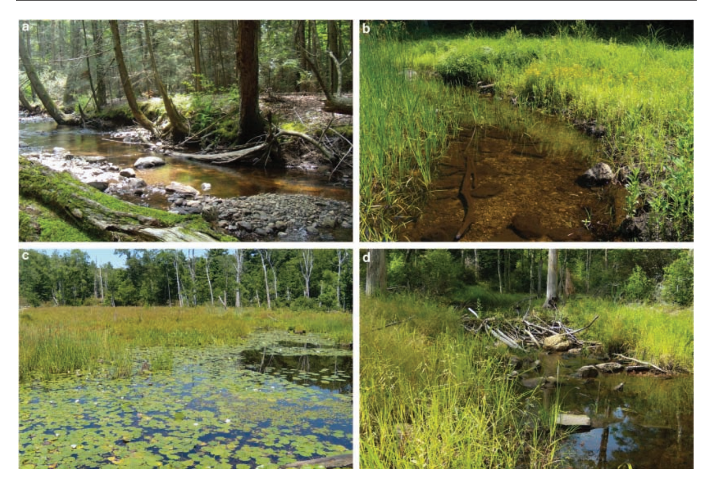
Figure 1. Examples of headwater segment types classified in this article: (a) free flowing, (b) beaver meadow, (c) valley beaver impoundment, and (d) in-channel beaver impoundment.

Note: Run-of-the-river dams are the most common existing and removed dam type in the United States (Poff and Hart 2002). Source: Müller-Schwarze and Sun 2003, Burchsted et al. 2009.