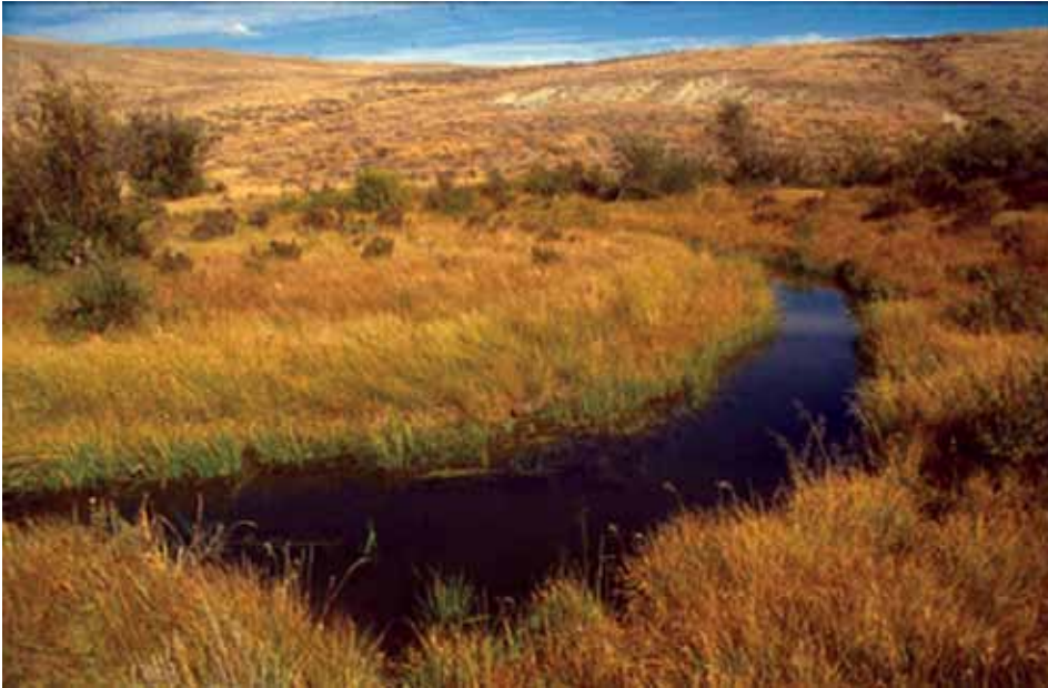
Figure 3. Price Creek, MT (1995). This beaver dam controlled reach is just upstream of Reach 3 in Table 2.

*By 1998 all the dams in the reaches that had been controlled by beaver dams had either totally failed or were failing.