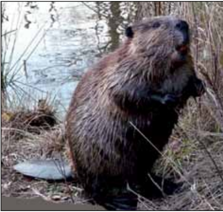
Figure 2. Beavers use their dexterous forepaws and orange incisors to build dams that impound water and restore wetlands.

acres were drained for cropland in the U.S. Midwest alone (Hey and Phillipi 1995). Much of the drained acreage later proved unsuitable for agriculture, yet the land's water storage, flood mitigation capacity, and complex, extensive wildlife habitat was dramatically reduced. With a few exceptions, many species of mammals, birds, amphibians, mussels, and fish have not recovered their numbers.