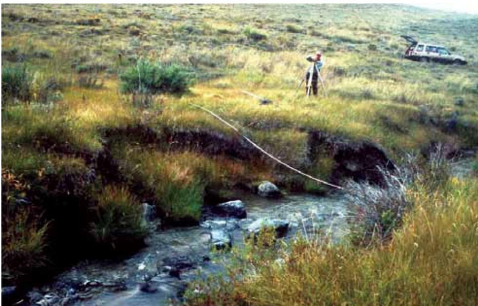
Figure 4. Price Creek, MT (1998). This is Reach 1, downstream of Figure 3. In both 1995 and 1998, this section lacked beaver dams.

down desirable trees. But challenges can be met with a creativity that benefits the beaver, the environment, and human communities. For instance, modern water level control devices are highly effective, and can be installed for an economical and environmentally sound, lasting solution (Brown et al. 2001; www.BeaversWW.org ). In addition, a variety of methods are available to protect special trees since beavers rarely engage in clear-cutting. Individual trees, or stands, can be guarded with sturdy fencing for long-term solutions.