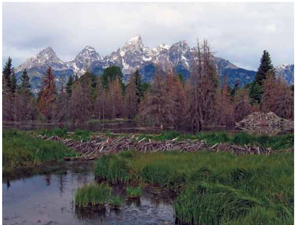
Figure 5. This beaver dam, pond, and lodge are located along the Snake River in Grand Teton National Park, Wyoming. Such public lands could be ideal places for more beaver wetlands.