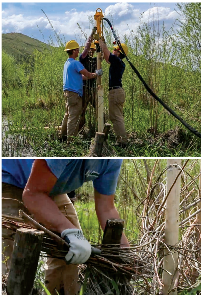
On Oregon's Bridge Creek, researchers create an artificial beaver dam by pounding logs into the stream bed (top), then weaving a lattice of sticks (bottom).